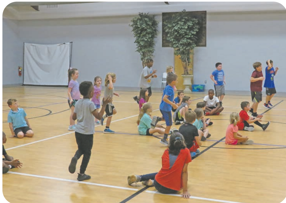
Kids at the Madison Upwards Basketball Camp take part in a "Simon Says" listening drill on Friday, June 25.