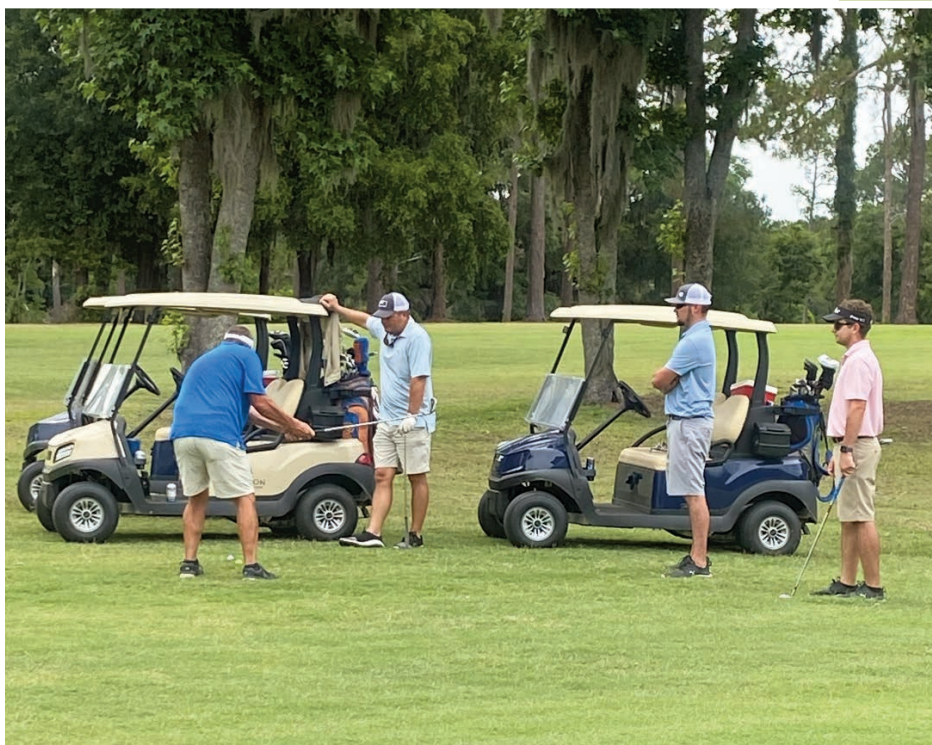
Teams from across North Florida and South Georgia participated in the Madison Shrine Club Golf Tournament.

Congratulations to the Madison Shrine Club for another successful tournament.