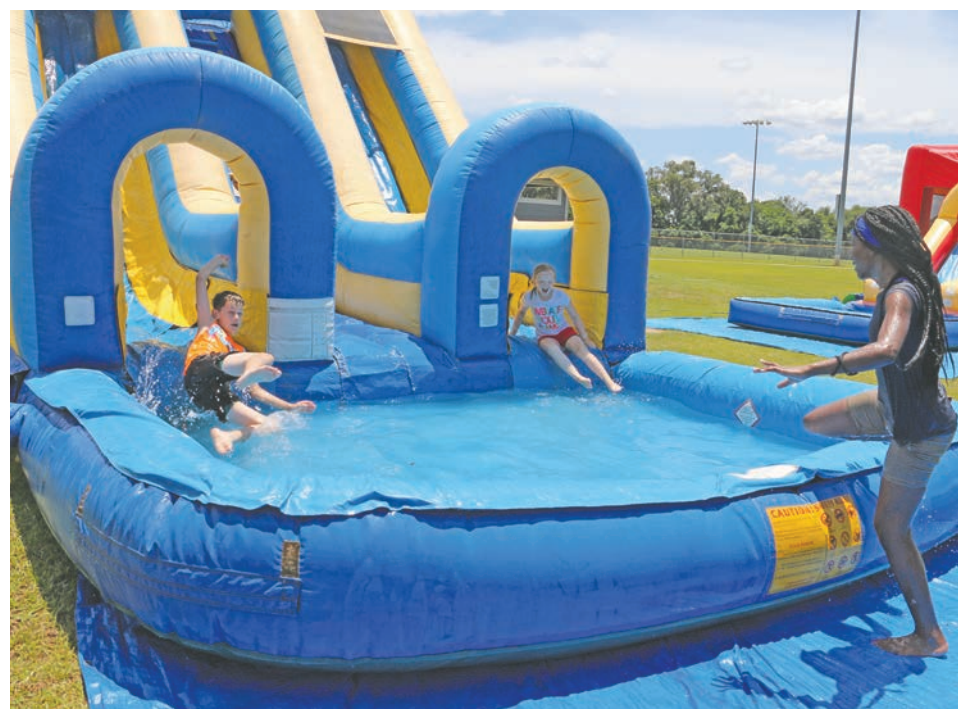
After a long day of learning, the children were able to play on a water slide to cool off.