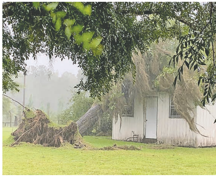
Elsa did uproot some trees and knock down several power lines, but no major property damage was reported.

- James Moore Certified Public Accountants and Consultants