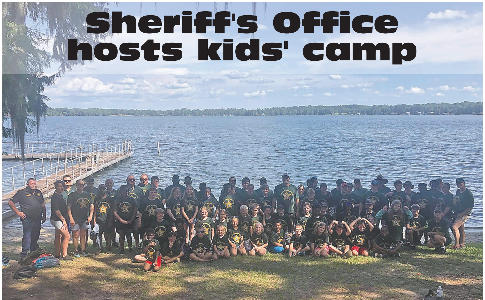
Kids and camp volunteers pose for a group picture after a long day of swimming.