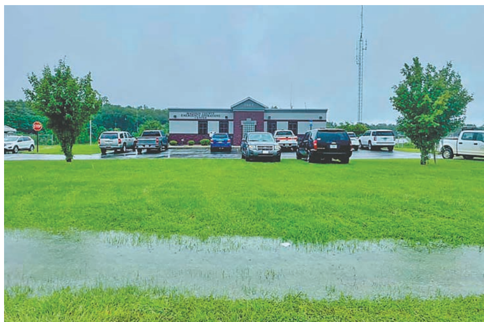
Elsa did manage to dump a significant amount of rain on Madison County as seen at the Madison Emergency Operations Center.